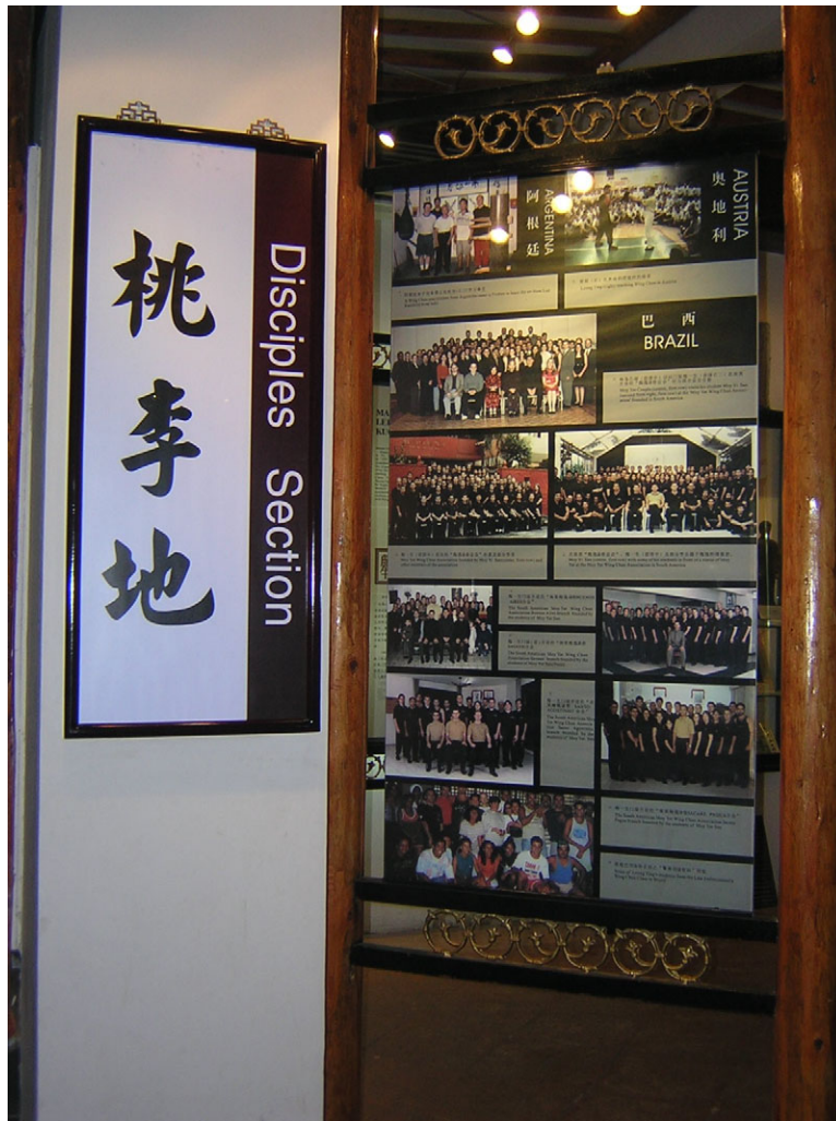
Entrance to Disciples Section