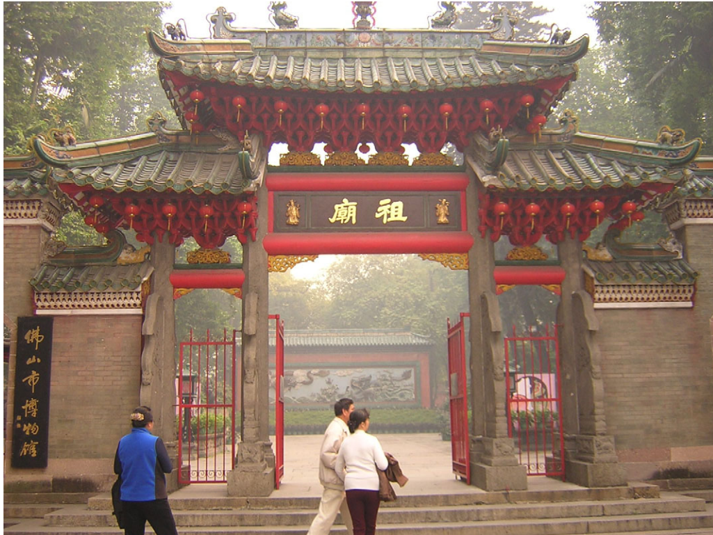
Gate to Ancestral Temple of Foshan

The Ancestral Temple of Foshan contains shrines of Chinese gods, a Chinese Opera stage, food and souvenir shops, as well as memorial halls for both Yip Man and Wong Fei Hong. From the picture above, Yip Man Tong is just to the left after one enters the front gate of the temple.