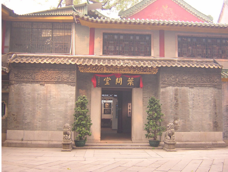
Front Door to Yip Man Tong

On December of 2003, I went on a vacation trip with my mother to my home city of Guangzhou, China. As this is very close to Foshan, late grandmaster Yip Man's home city, we decided to take this opportunity to fulfill a 詠春 Wing Tsun pilgrimage.