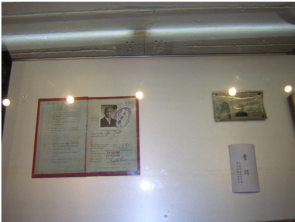
Grandmaster Yip Man's ID and Passport