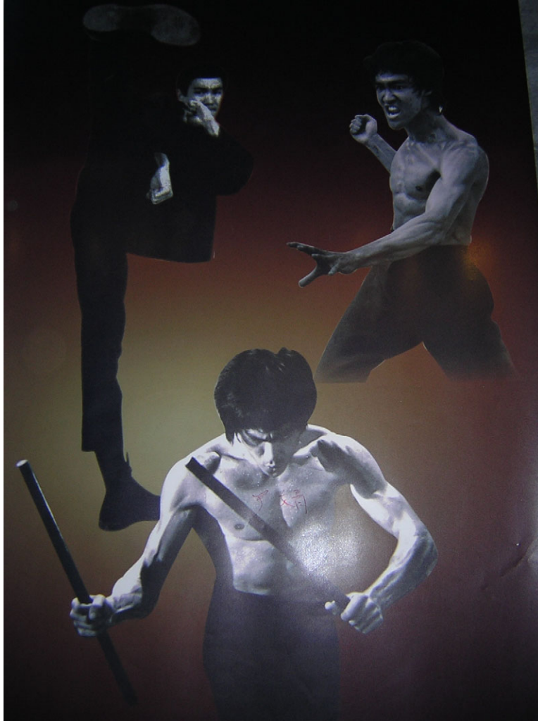
Action Photo of Bruce Lee