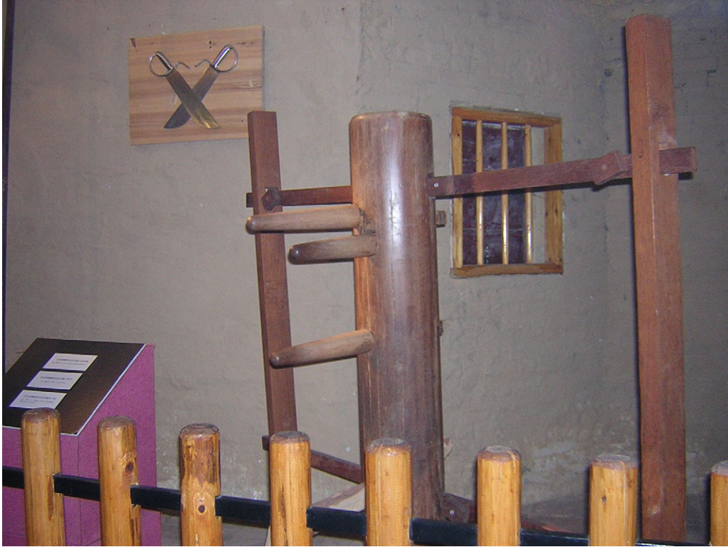
詠春 Wing Tsun's Bart Jam Dao and Muk Yun Jong