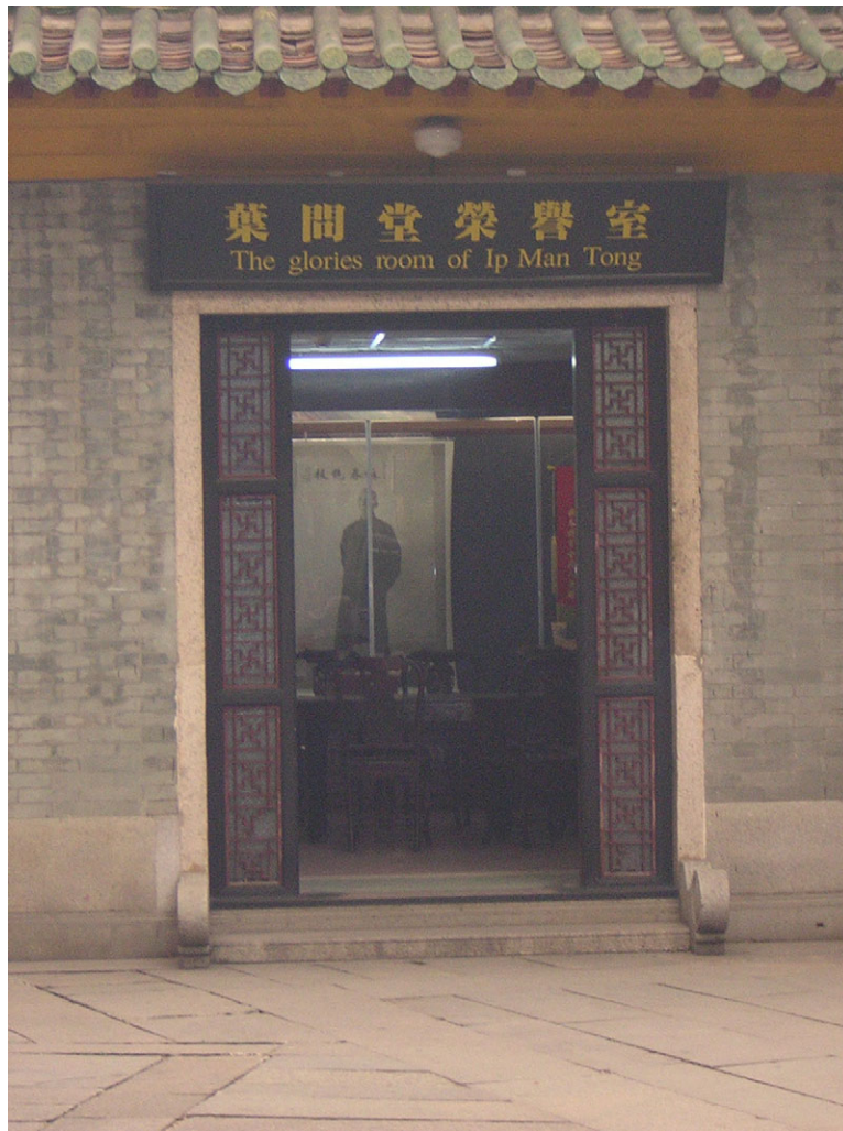
The Entrance to “The glories room of Ip Man Tong”

The main building of Yip Man Tong is divided into several sections: Disciples Section, Main Hall, and the Kung Fu Corridor.