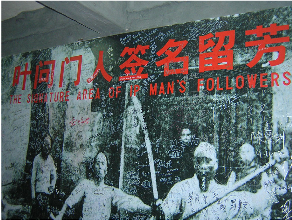
Wall of Signatures of Grandmaster Yip Man's followers who attended the Opening Ceremony

This concludes the visit to Yip Man Tong, the memorial hall of grandmaster Yip Man located in the Ancestral Temple of Foshan. To unfamiliar guests, the memorial hall may be just one of the many displays that one can view in the Ancestral Temple of Foshan; but to 詠春 Wing Tsun students, it is a treasure trove of 詠春 Wing Tsun history and an opportunity to learn more about and relate to our grandmaster Yip Man. The pictures presented here are very limited in conveying the rewarding experience of visiting Yip Man Tong. Even a two-hour stay and carefully taking pictures of all the displays do not serve it justice. I highly recommend that fellow students of 詠春 (Wing Tsun, Wing Chun, Ving Tsun) should spend some time there whenever they are in the area of Foshan, China.