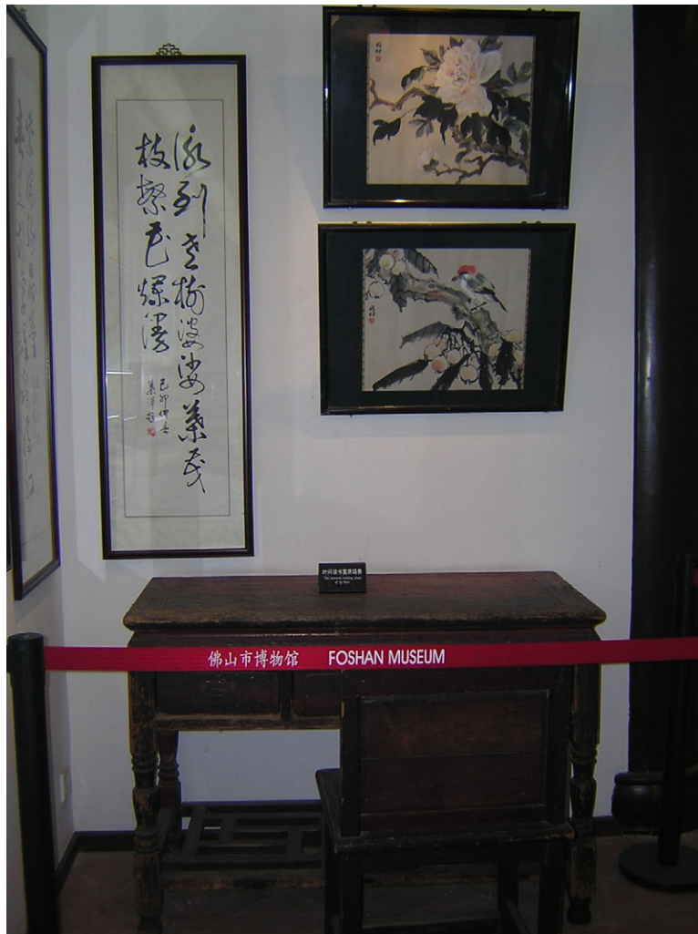
Grandmaster Yip Man's Study