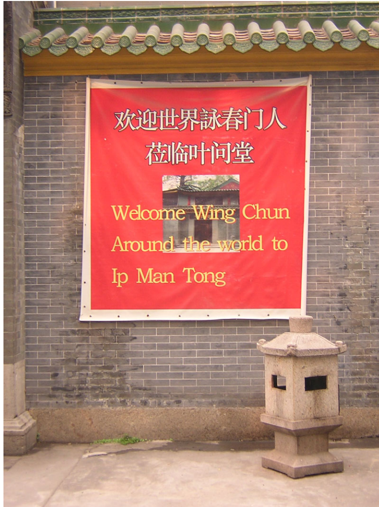
Welcoming Sign in front of Yip Man Tong

To the left of Yip Man Tong, we find a room called “The glories room of Ip Man Tong”. This room displays the many banners and flags that were presented by students of Wing Tsun from around the world and opening day souvenirs that were given out to those who attended the opening ceremony on November of 2002.