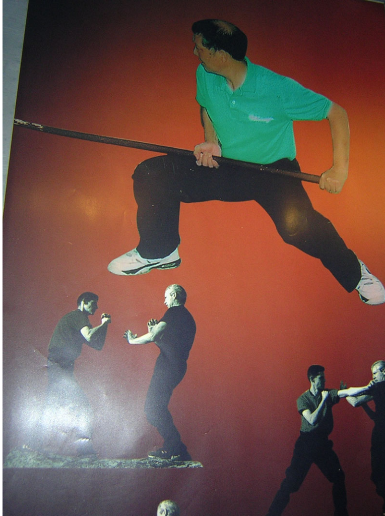
Collection of Photos of 詠春 Wing Tsun in Action