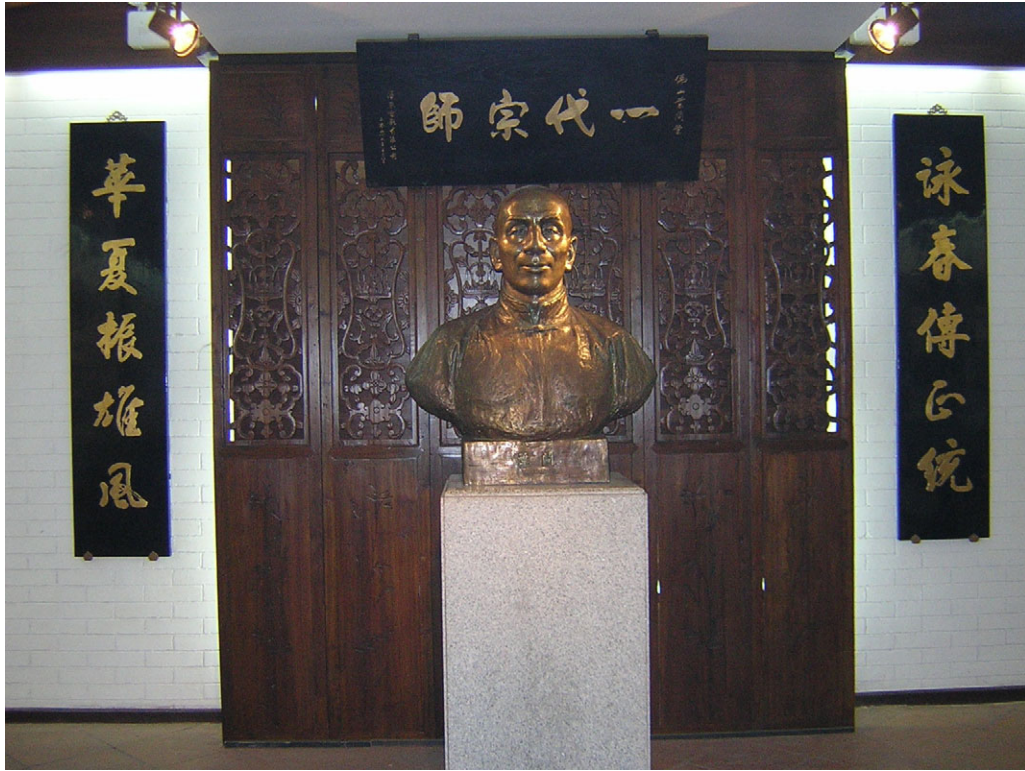
Grandmaster Yip Man's Bronze Statue