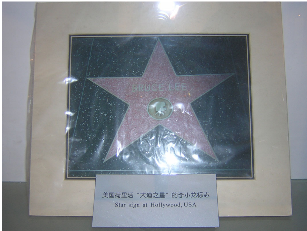
The Hollywood Star of Bruce Lee, one of Yip Man's most famous students

The Main Hall section of Yip Man Tong is the room dedicated to preserving Grandmaster Yip Man's legacy. It comprises of displays of black and white pictures that span the life of Grandmaster Yip Man; relics such as his study desk, his walking stick, and his collection of books on martial arts and Chinese medicine; as well as a giant bronze statue of Grandmaster Yip Man himself with his biography engraved in marble slabs. It is truly an honourable display reflecting the grandmaster's simple elegance as a Confucian scholar.