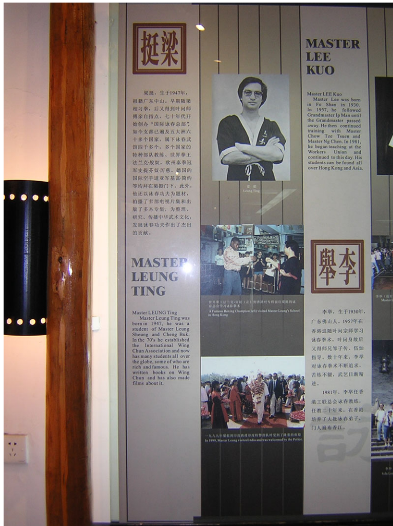
Grandmaster Leung Ting's Display