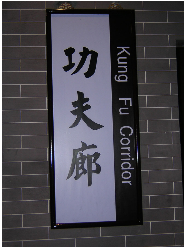
Sign at the Entrance of the Kung Fu Corridor

The Kung Fu Corridor consists of a display of 詠春 Wing Tsun's weapons and training tools including the Bart Jam Dao (Eight Slash Knives), Luk Deem Buen Gwun (Six Points and a Half Pole), and Muk Yun Jong (Wooden Dummy). It also displays various action photos of practitioners performing 詠春 Wing Tsun techniques and a wall of photos containing all the techniques in the Muk Yun Jong form (no photos were allowed to be taken here). This room illustrates 詠春 Wing Tsun in action to the visitors who may not have a background in martial arts or may not have seen 詠春 Wing Tsun previously. The weapons, training tools, and photos present 詠春 Wing Tsun in its dynamic and efficient form.