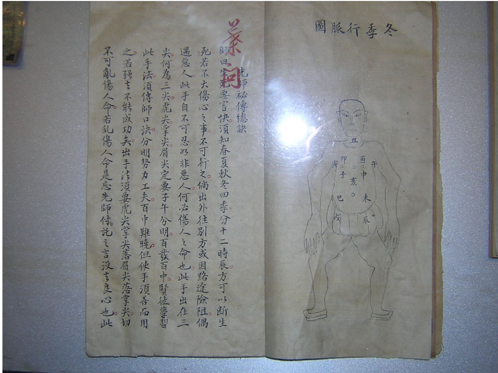
One of the Three Books written by Leung Jan in Grandmaster Yip Man's Library