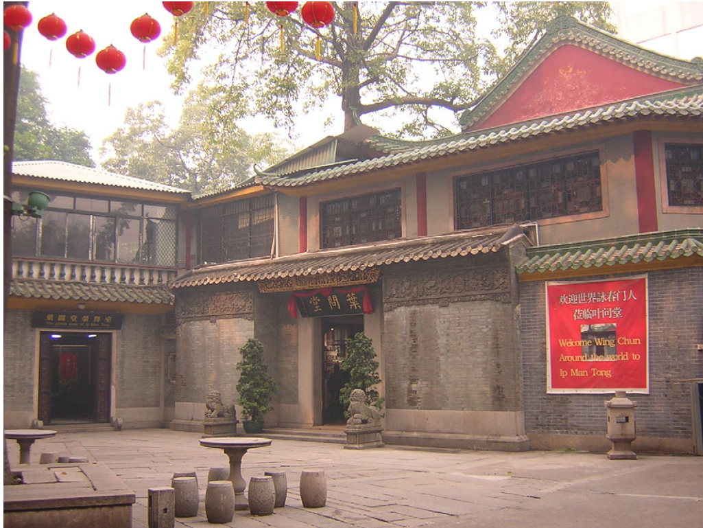
Complete View of Yip Man Tong