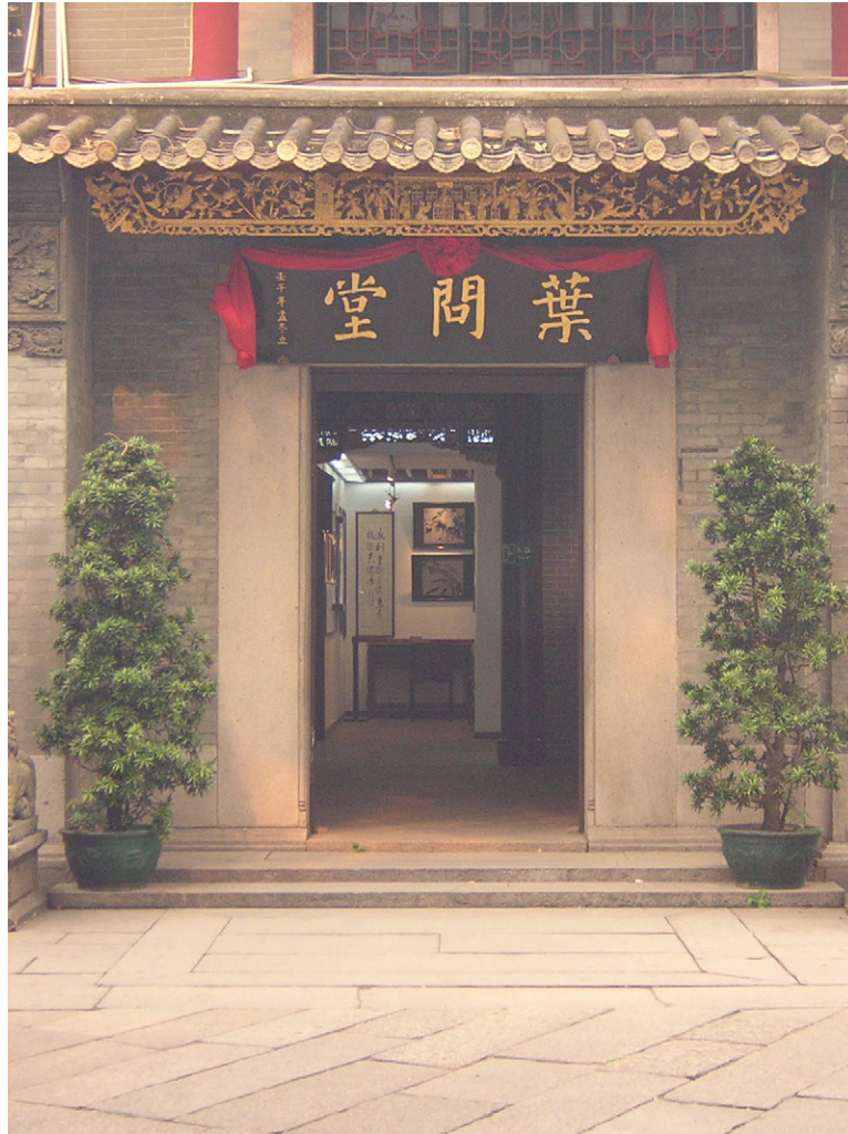
Entrance to Main Building of Yip Man Tong

The Disciples Section is a display of how big the 詠春 Wing Tsun family is, showcasing the many branches and instructors around the world. The leading instructors of each country and branch are presented here with pictures, their biographies, and their contributions to 詠春 Wing Tsun (e.g. books).